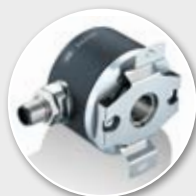
Blind hollow shaft