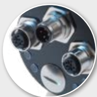
3 x M12