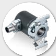
Blind hollow shaft